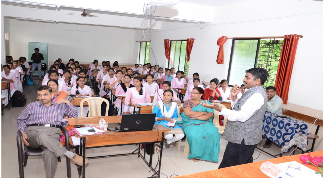
A Workshop on Soft Skills and Human Values