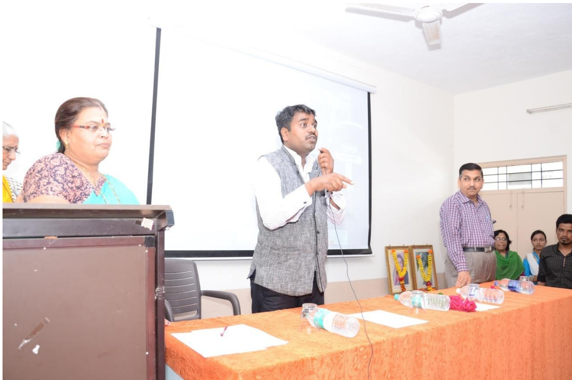
Resource person from Bahai Acdemy ,Panchagani guiding the students